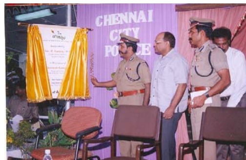
Police Commissioner R. Nataraj inaugurates the Arumbu project